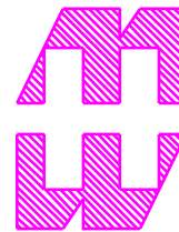
VIEW OF BASE (INSIDE)